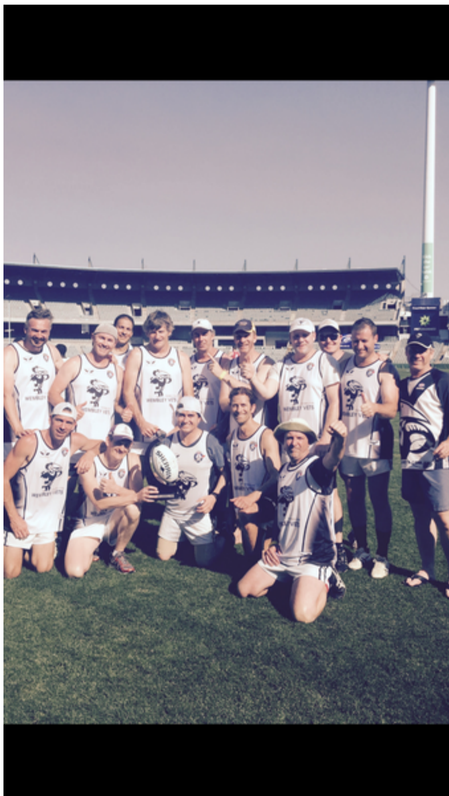
The Motely Crew