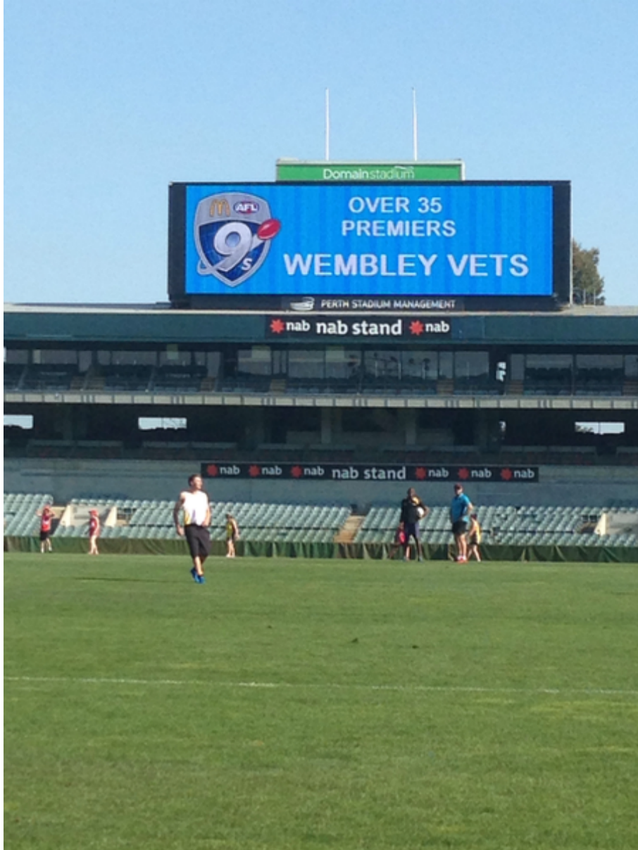
The Scene of the Crime